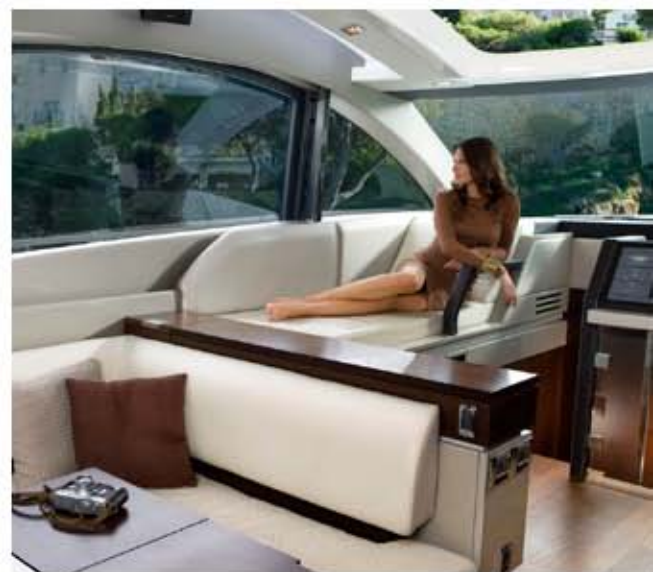
Opposite The Princess Emma chartered power cruiser in Cape Town is operated by the Last Word group of 'intimate' hotels. Above left to right The Fairline Targa 58 Gran Turismo, available from Boating World.

W e all like to dream. Win the Lotto, drive an Aston Martin, own a sea-facing penthouse in Clifton, or spend the rest of our lives travelling the world on permanent vacation.