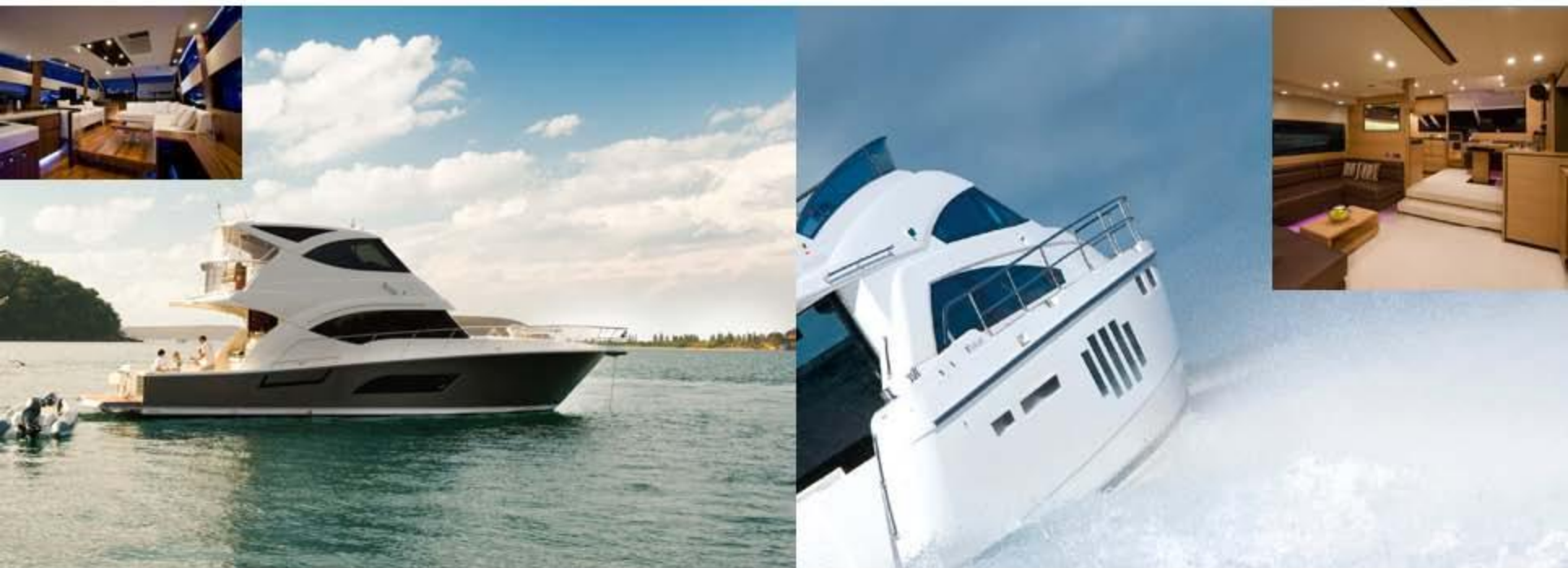
Above left and inset The Riviera Flybridge Enclosed 53 IPS at anchor; hardwood floors multiply the feeling of luxury. Above right and inset The Fairline Squadron 58 makes waves; the Squadron 58's roomy interiors.

R2,5 million each. With running and maintenance costs split 10 ways, it suddenly becomes a more viable option, and as larger vessels include a skipper, all you have to do is walk on board, have fun and then walk off.